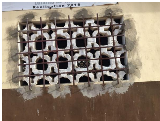
Securing the windows

We will keep you updated on the next steps.